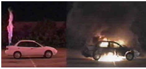
Hydrogen car (l), gasoline car (r). Photo from a video that compares fires from an intentionally ignited hydrogen tank release to a small gasoline fuel line leak. At the time of this photo (60 seconds after ignition), the hydrogen flame has begun to subside, while the gasoline fire is intensifying. After 100 seconds, all of the hydrogen was gone and the car's interior was undamaged. (The maximum temperature inside the back window was only 67°F!) The gasoline car continued to burn for several minutes and was completely destroyed. Photo/Text: Dr. Swain, University of Miami.

be very low. However, at low concentrations (below 10%) the energy required to ignite hydrogen is high—similar to the energy required to ignite natural gas and gasoline in their respective flammability ranges—making hydrogen realistically more difficult to ignite near the lower flammability limit. On the other hand, if conditions exist where the hydrogen concentration increased toward the stoichiometric (most easily ignited) mixture of 29% hydrogen (in air), the ignition energy drops to about one fifteenth of that required to ignite natural gas (or one tenth for gasoline). See Figure 1 (page 1) for more comparisons.